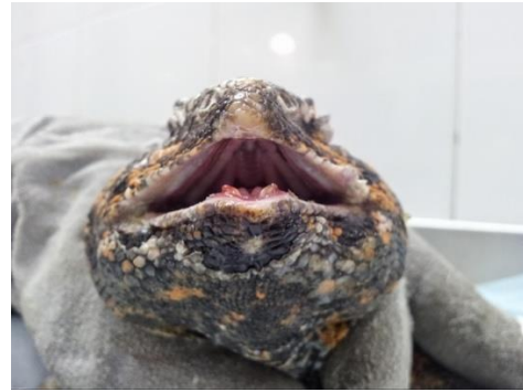
Fig. 2. Lips in shedding after ceftazidime 20mg/kg every 48 hours for 57 days.

Currently, Devriesea agamarum is the only member of a newly described genus within the class Actinobacteria . This bacterium is a non-motile, non-spore-forming and non-acid-fast gram positive small rod that occur singly, in pairs or in short chains and that grew on sheep blood agar as small hemolytic mucoid and whitish colonies after 24 h of incubation at 25-42 °C under aerobic, microaerophilic or anaerobic conditions (Martel et al. , 2008). Partial ribosomal RNA gene sequences and the full genome sequence of the D. agamarum strain IMP2 and a partial 16S ribosomal RNA gene sequence from a bearded dragon with concurrent Chrysosporium guarroi infection have been deposited in the European Nucleotide Archive (Schmidt-Ukaj et al. , 2014; Haesendonck et al. , 2015).