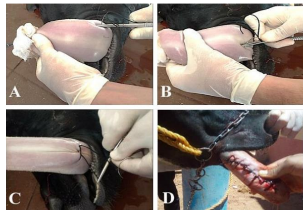
Fig. 1. Steps of the suturing process during one-shot tongue reshaping. (A): Application of the first bite to one side of the midline of the tongue. (B): The needle is crossed over and a second bite is taken at the opposite side of the tongue. (C): The suture is tied in square knot. (D): Multiple interrupted inverting sutures are applied starting at the base and advanced toward the tip of the tongue.

The tongue is irrigated again with sterile saline solution and betadine mouth wash. The tourniquet is removed and the tongue is checked for bleeding or other complications. The contour of the tongue is checked for its new modification and the tongue is not able to form the "U" shape for sucking. Then, the anesthetized tongue is replaced into the mouth cavity and the cow is permitted to stand up.