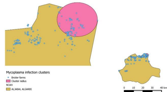
Fig. 2. Geographical localization of Mycoplasma infection clusters in Al-Jabal Al-Gharbi region.

Spatial analysis identified one significant cluster of Mycoplasma infection ( P < 0.01 ) (Fig. 2; Table 6). This cluster is mostly located within Garian's administration borders.