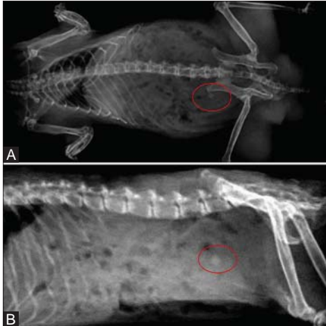
Fig. 1. Radiographic ventro-dorsal (A) and radiographic latero-lateral (B) projections of a 14 months old intact male Syrian hamster under general anesthesia showing a radio-opaque urolith (red circle).