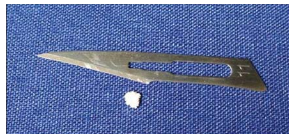
Fig. 4. Particular of the urolith in relationship to a #11 surgical blade.

containing palmitoylethanolamide (PEA), glucosamine and hesperidin was added to the animal's regular diet. These three active ingredients are present in one single veterinary capsule, commercially available in Italy (Urys®, Innovet, Italy). The manufacturer's recommendation is to administer the liquid contained in one capsule for every ten kilograms of body weight for dogs and cats, and the indications for this product include preservation of the physiologic protective mechanisms of the urinary tract, protection from inflammation and oxidative damage, as well as preserving normal mucosal function. The content of one capsule was aspirated with a disposable 1 ml syringe, and one drop (about 0.025 ml) was given once a day orally to the animal, after the needle was removed from the syringe. The administered dose is equivalent