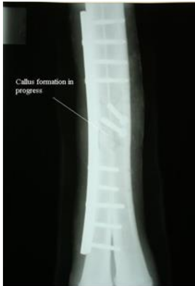
Fig. 3. Dorso-plantar radiograph (eight weeks post-operation). Callus formation in progress.

The animal recovered from injury without major complications except slight lameness after 16 weeks of surgery, but was able to bear full weight on the affected leg when the forelimb of the same side was picked up. The radiographic pictures two and four weeks after surgery revealed that the plate and screws were in place while radiographic examination eight weeks after surgery was indicative of good progress of callus formation (Fig. 3). The radiograph 16 weeks after surgery was indicative of a bridging callus (Fig. 4).