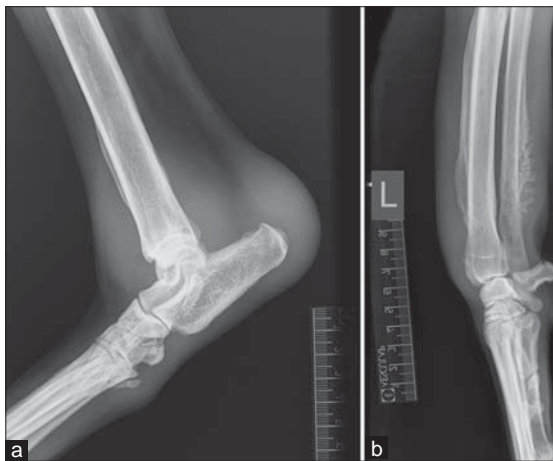
Fig. 3. (a) Medio-lateral view of the right hock shows marked soft tissue swelling, lamellar periosteal reaction on distal tibia, dorsal and plantar aspect of the tuber calcis and dorsally on the metatarsal bones. (b) Medio-lateral view of the left antebrachium shows marked soft tissue swelling, diffuse lamellar periosteal reaction on the cranial aspect of the radius and lamellar and palisading periosteal reaction on the distal ulna diaphysis.

The main challenge in the management of this case was the recurrence of the metastases in the sublumber lymph nodes with a concomitant hypercalcaemia. Control of the tumour and the nodal metastases resulted in normalization of the calcaemia. Oral bisphosphonate (clodronate) was preferred to injectable bisphosphonate in this case due to the good clinical condition of the dog and the resolution of the hypercalcaemia after tumour