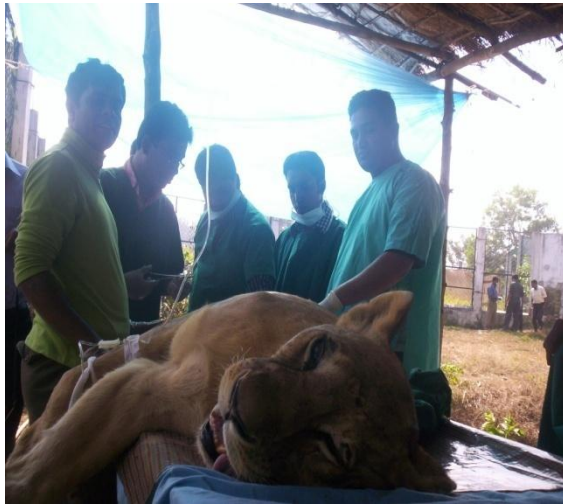
Fig.1 Anesthesia of lion