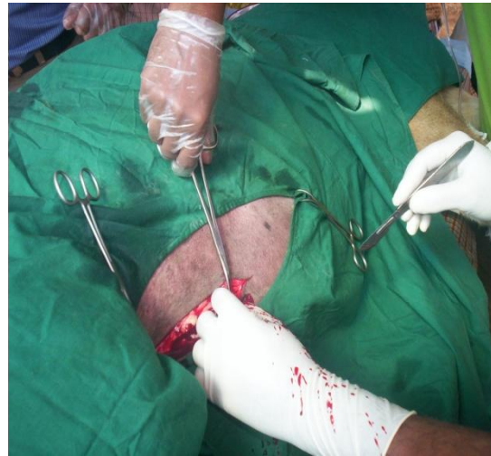
Fig.2 Skin Incision over the midline for caesarean section